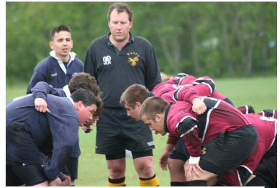
Springfield Collegiate Rugby

It is anticipated that revenue will be generated by rental of this field to users outside of our community. Close proximity to Winnipeg means that this will happen in a couple of ways;